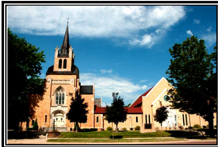
Saints Peter & Paul Catholic Church 214 S. Holland Blue Earth, Minnesota