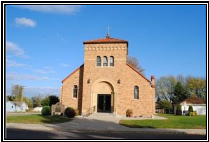
Saint Mary Catholic Church 32 1 st St. NE Winnebago, Minnesota